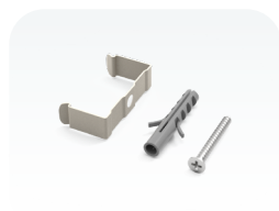
K-73 fastening set